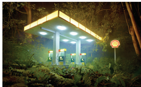
02. David LaChapelle Gas Shell, 2012