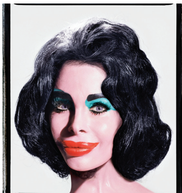
03. David LaChapelle Amanda As Andy Warhol's Liz, 2003