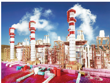
01. David LaChapelle Land Scene: Kings Dominion, 2013

Permission is granted for the image material to be used in print media or in temporary online publication. It may only be used in direct connection with coverage of the exhibition DAVID LACHAPELLE. ONCE IN THE GARDEN at Gallery OstLicht. Images may be neither cropped nor retouched. Image files must be removed from the archives after use.