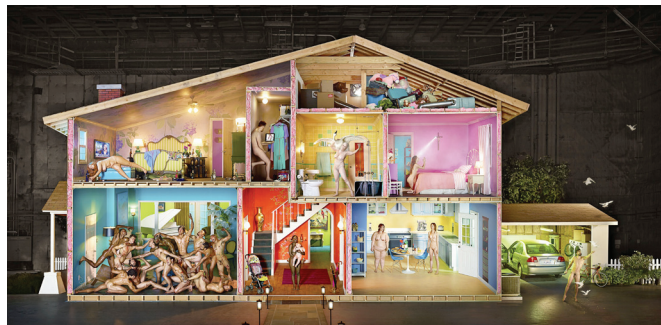
09. David LaChapelle Self-Portrait as House, 2013 © David LaChapelle