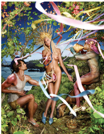
05. David LaChapelle Rebirth Of Venus, 2009