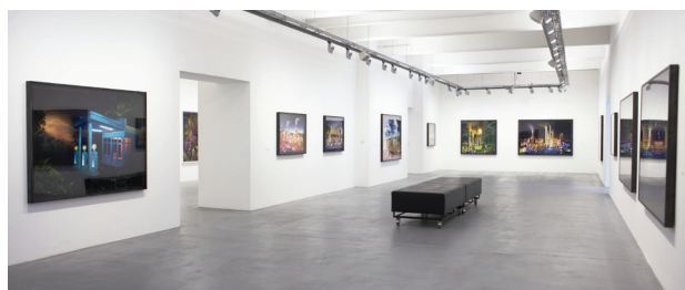
16. Exhibition View, Galerie OstLicht, DAVID LACHAPELLE. ONCE IN THE GARDEN