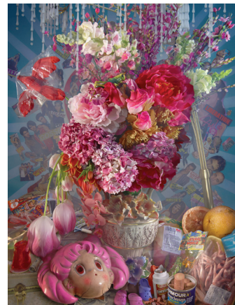
06. David LaChapelle Springtime, 2008-2011