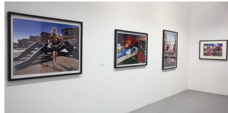
13. Exhibition View, Galerie OstLicht, DAVID LACHAPELLE. ONCE IN THE GARDEN