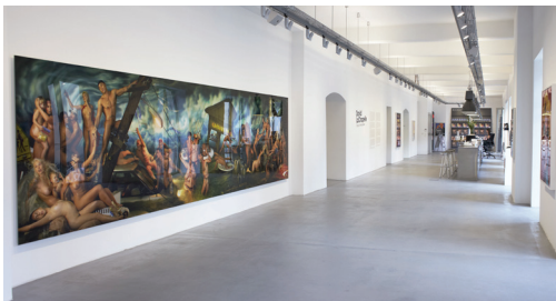
12. Exhibition View, Galerie OstLicht, DAVID LACHAPELLE. ONCE IN THE GARDEN